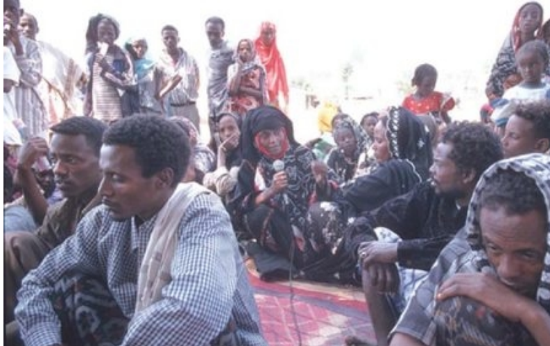
Men and women debate at the desert conference